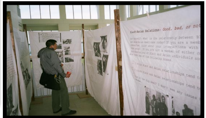
Left: a-APIAH month fliers May 2007, Top Right/Bottom: c, b-Art Installation created by artist Tri Quach.

response to last year's art installation clearly illustrates (photo a).