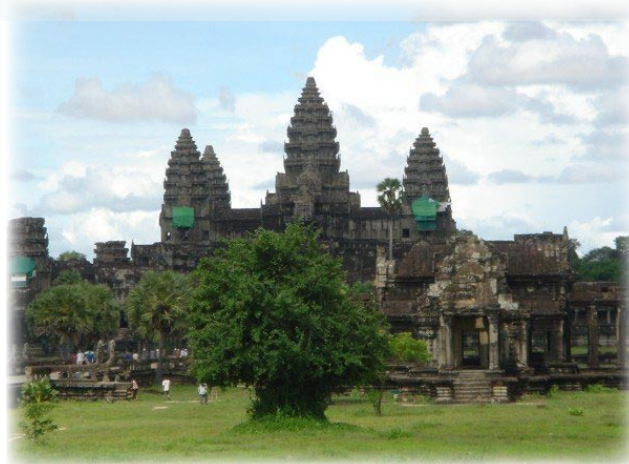
Angkor Wat, Cambodia.

Once I got to Hanoi- there are billboards EVERYWHERE in the country side in the rice fields! I heard these boards are really unstable and have fallen and hurt people. But imagine the congestion of New York billboards times 2, in the middle of green rice fields! It’s such a paradox! But the fields are right on the highway where a lot of cars would pass by coming from the airport. There are fields and fields of green rice stocks (which means its not yet harvest season bc it would be golden then). And I saw people,