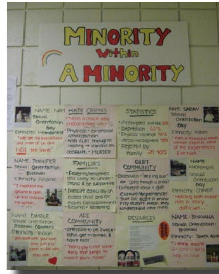
Current Minority within a Minority Board located in front of the AsAmSt Outreach office.

"It is up to us to tell our story because no one else will."