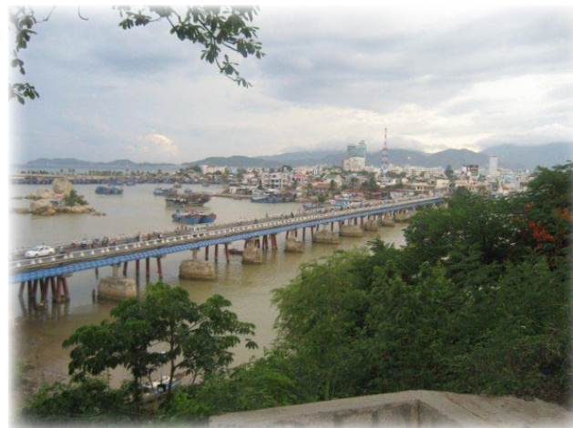
Nha Trang, Vietnam.

women dressed in ao ba ba like my grandmother, pants rolled up to their knees in straw hats, bent over these grains cutting them each handful at a time. During harvest season, these entire fields would be cut meticulously by hand!!!