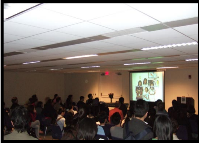
AsAmSt 370's Spring 2007 exhibition had a large number of attendees who came to support